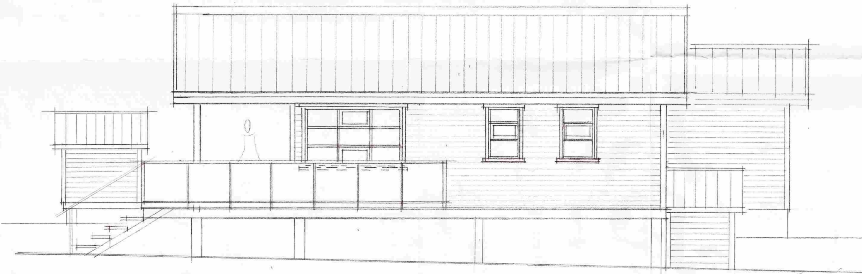
UTLIT AUSTUR M 1:50