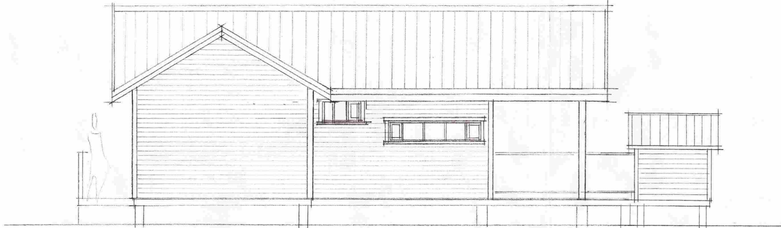
UTLIT VESTUR M 1:50

SAMPYKKT 15 APR, 2009 Ólafur Kjartansson Byggingafræðingur og Flóahfr. Byggingafræðingur og Flóahfr.