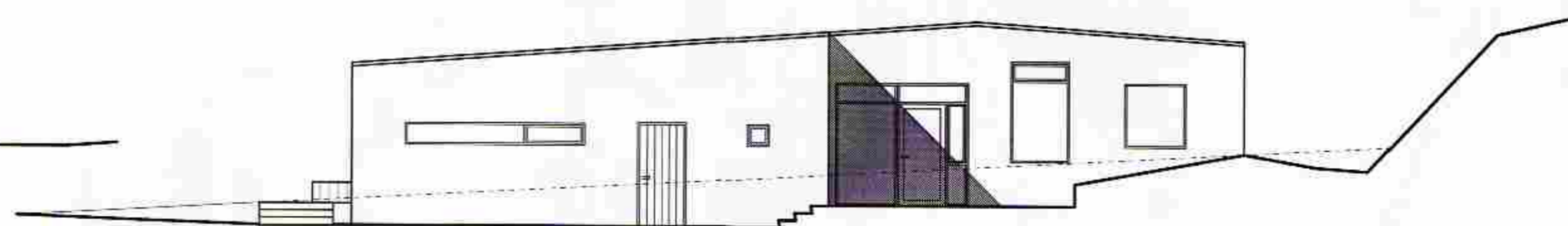
ÚTLIT AUSTUR 1:100