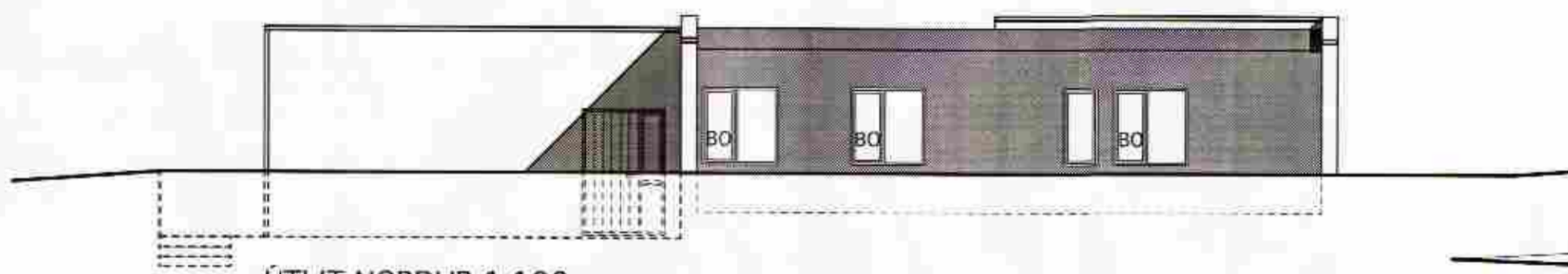
ÚTLIT NORÐUR 1:100