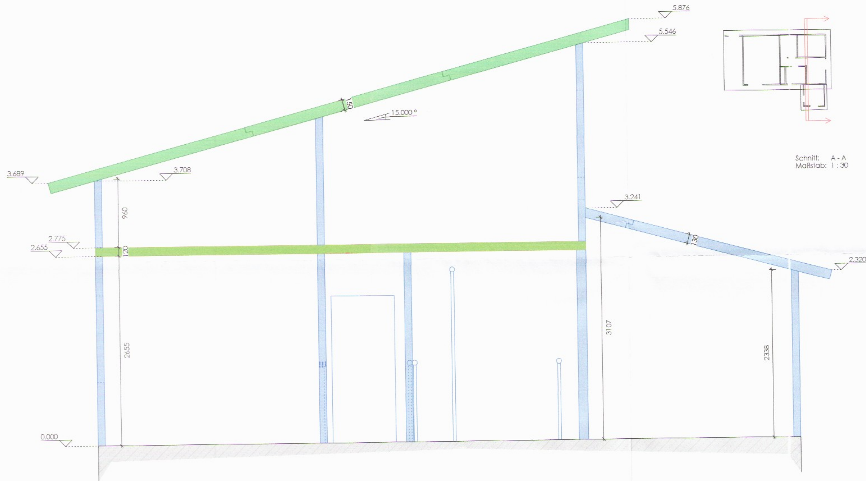
Schnitt: A - A Maßstab: 1 : 30

Umhverfis- og tæknisvið Uppsveita Yfirfarið 06. ágú. 2019 f.h. hildmar Byggingarfulltrúi