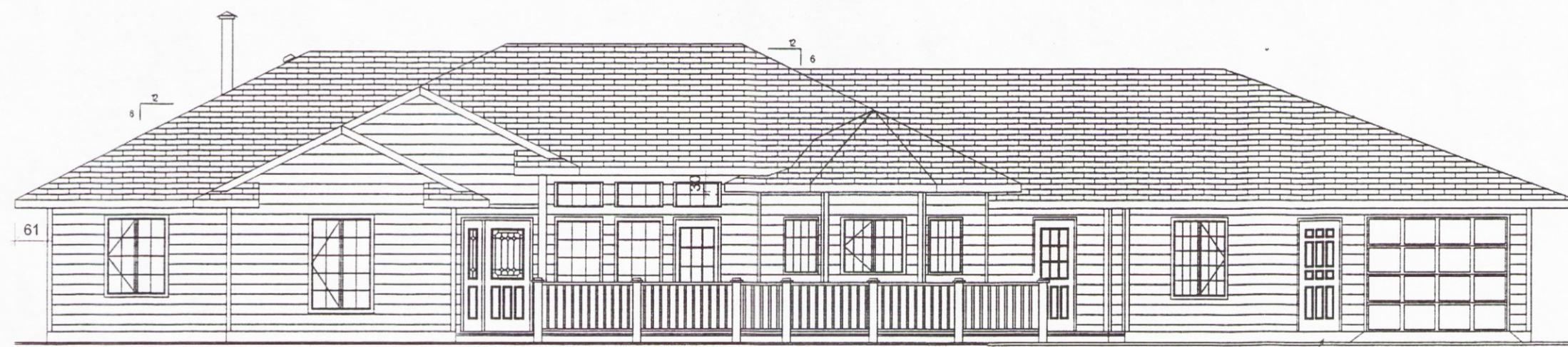
FRONT ELEVATION SUÐLÆG HLIÐ