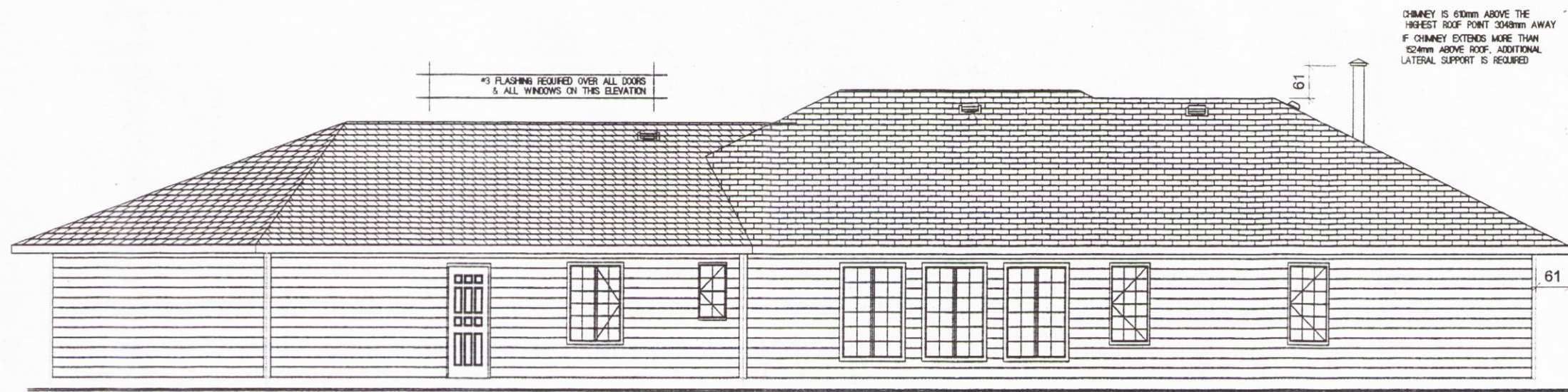
REAR ELEVATION NORÐLÆG HLIÐ

SAMÞYKKT PANN 11-4-2001 BYGGINGAÞULLTRÚINN Í FLÓA