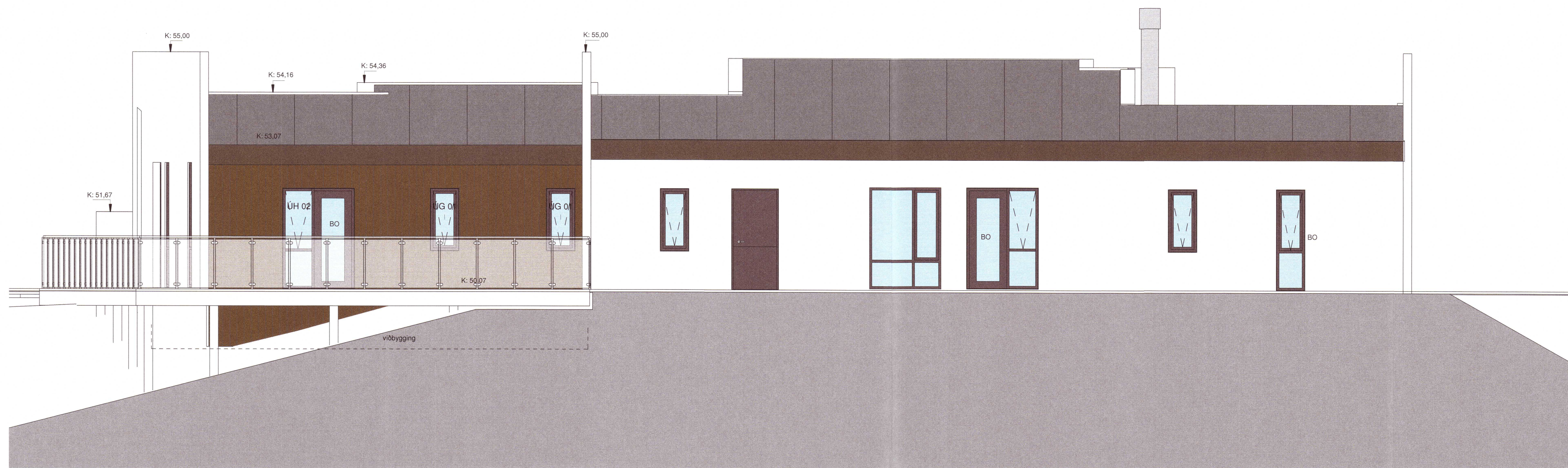
1 Útlit austur 1/50 1 : 50