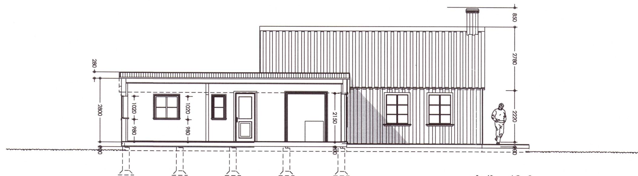
Sneiðmynd C - C