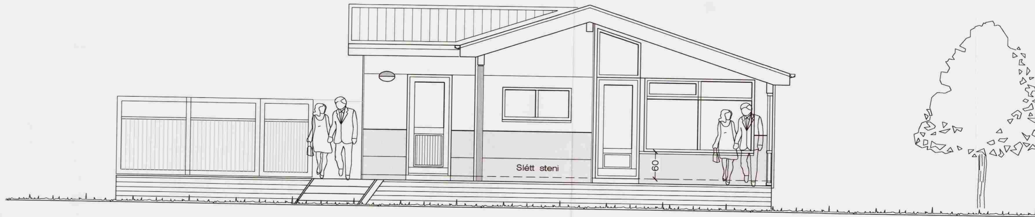
Suðurhlið. 1 : 50

Oddsholt 34 Grímsnesi. Útlit - Sneiðing.