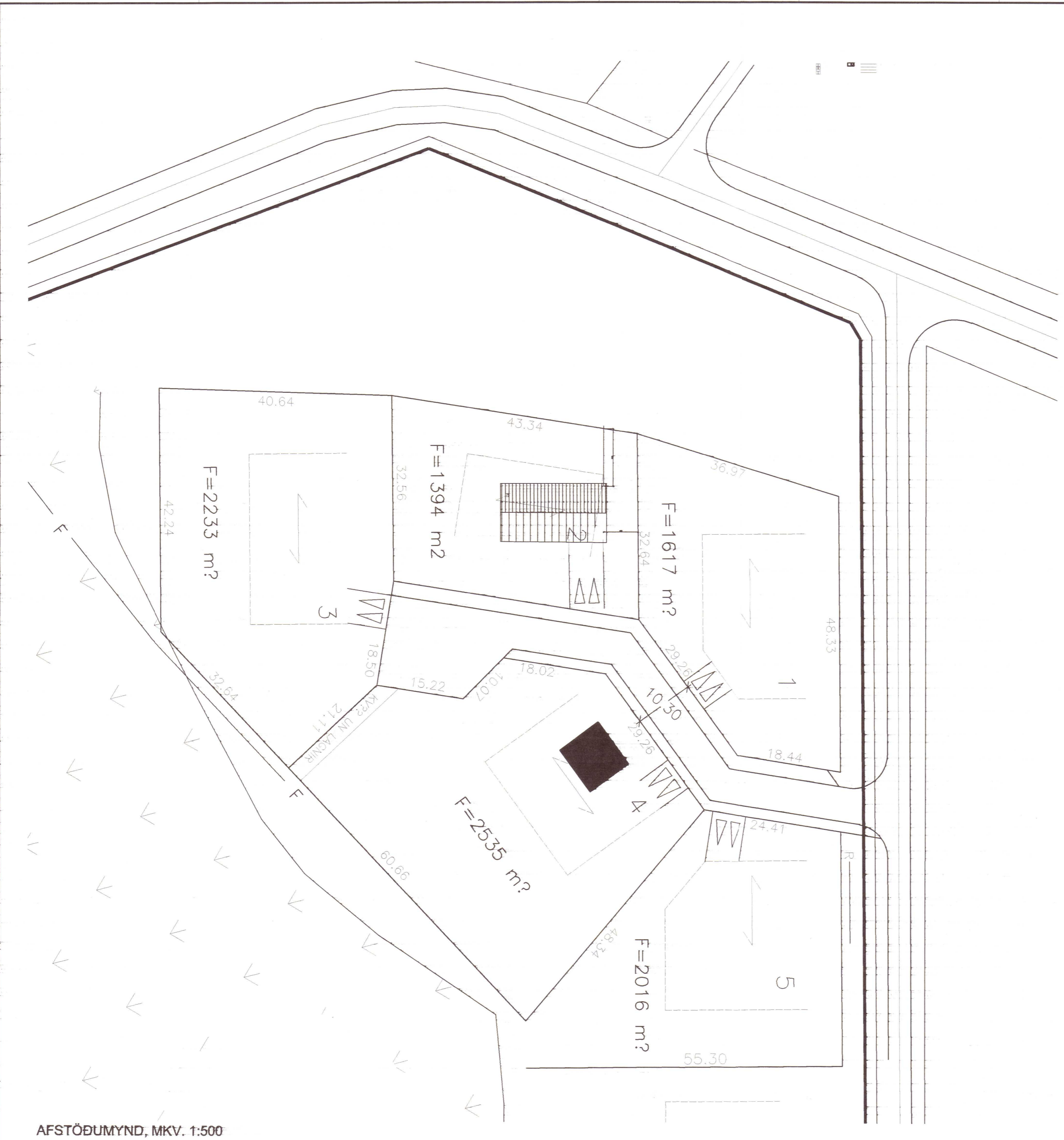
AFSTÖÐUMYND, MKV. 1:500

3-3-2003 Guðni Sigurðsson BYGGINGAFULLTRUINN Í FLÓA