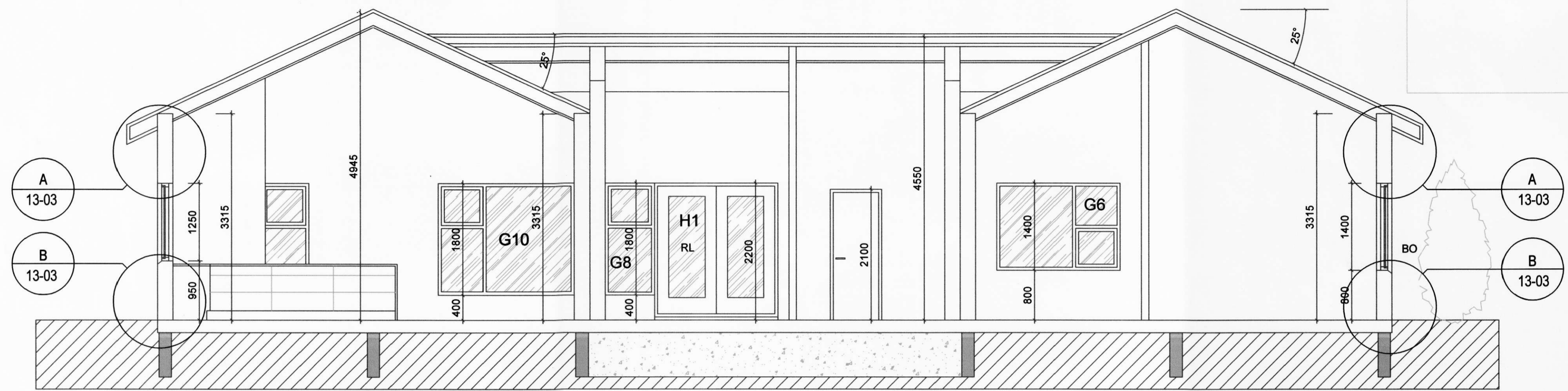
SNEIÐING Z-Z 1:50